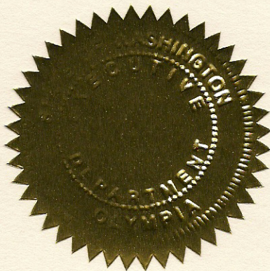
Governor Christine O. Gregoire

A handwritten signature in blue ink that reads "Chris Gregoire".